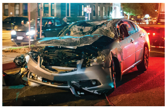
SEE PAGE ONE

This publication is intended to educate the general public about personal injury, medical malpractice, and other issues. It is for information purposes only and is not intended to be legal advice. Prior to acting on any information contained here, you should seek and retain competent counsel. The information in this newsletter may be freely copied and distributed as long as the newsletter is copied in its entirety.